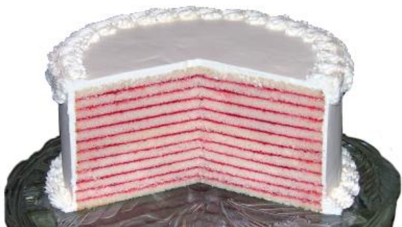
Flat and Parallel Layers (as thin as 1/8") Every Time!

The Most Accurate and Precise Cake Leveling and Torting Tool designed exclusively for the Baking Professional who demands accuracy as well as ease of use